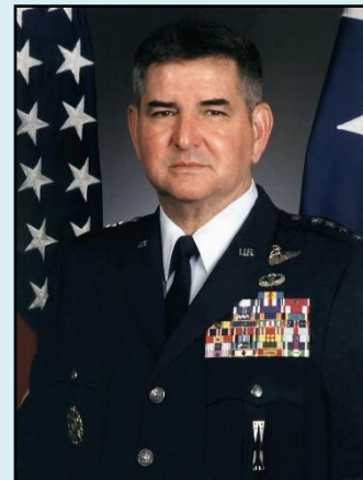
General Ronald R. Fogleman, 15th Chief of Staff, United States Air Force

The other Services have air arms—magnificent air arms—but their air arms must fit within their Services, each with a fundamentally different focus. So those air arms, when in competition with the primary focus of their Services, will often end up on the short end, where the priorities for resources may lead to shortfalls or decisions that are suboptimum. It is therefore important to understand that the core competencies of [airpower] are optional for the other Services. They can elect to play or not play in that arena. But if the nation is to remain capable and competent in air and space [sic], someone must pay attention across the whole spectrum; that is why there is a US Air Force.