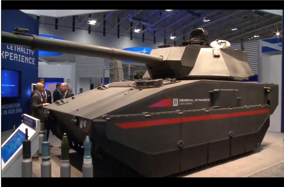
Figure 3. GDLS Griffin III Prototype