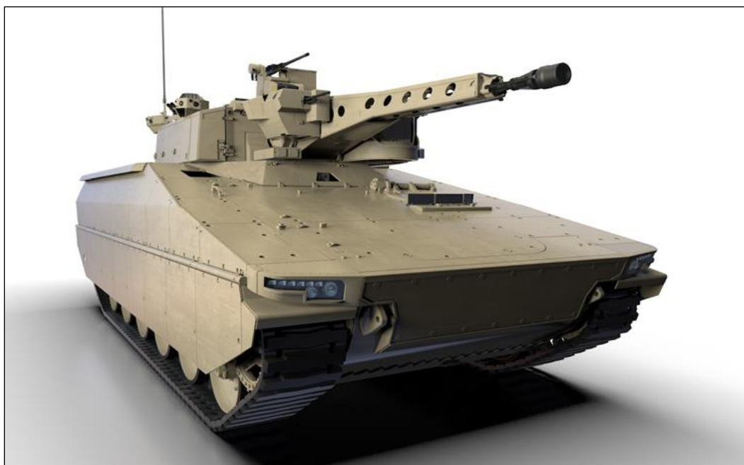
Figure 4. Raytheon/Rheinmetall Lynx Prototype