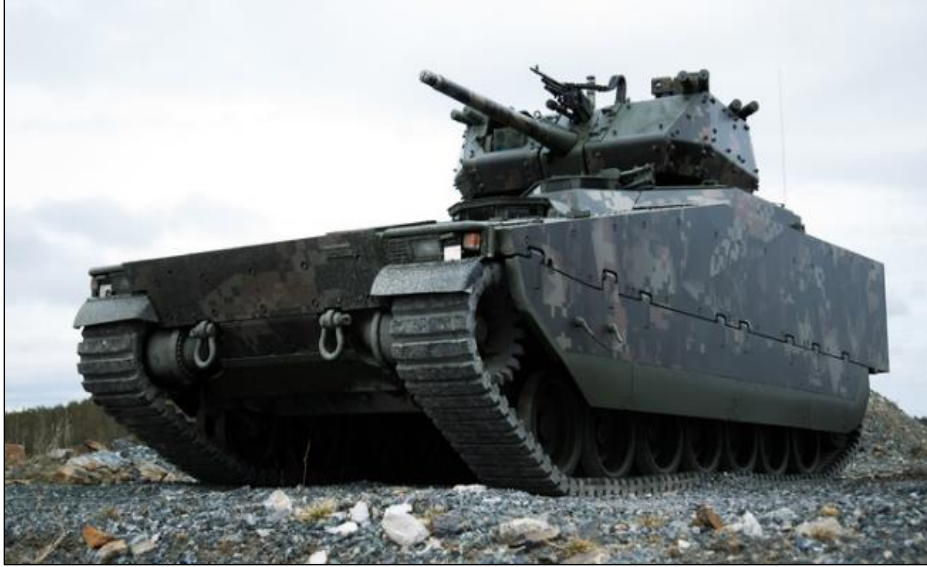
Figure 2. BAE Prototype CV-90