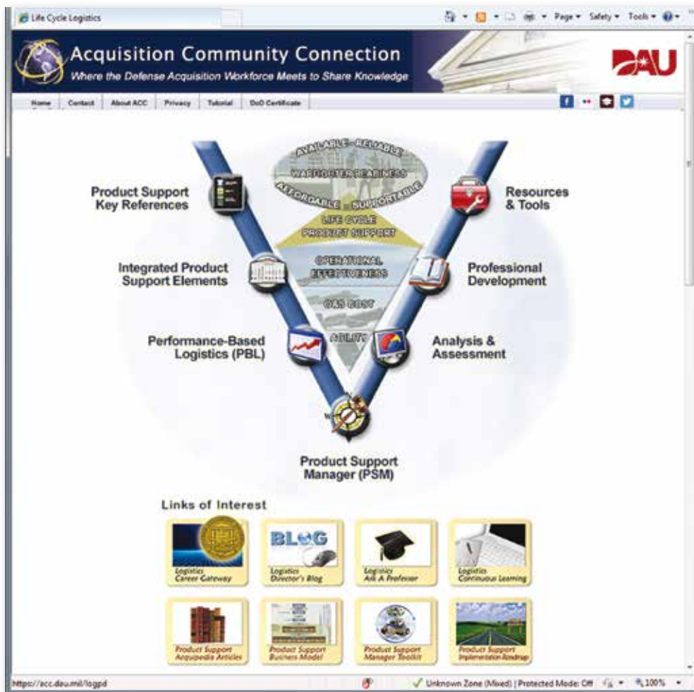
Figure 1. Life Cycle Logistics Community of Practice (LOG CoP)