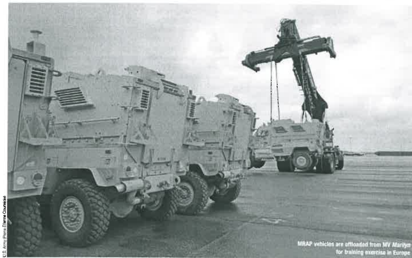
MRAP vehicles are offloaded from MV Marilyn for training exercise in Europe

General James Cartwright (2007–present). While it is too early to provide definitive insights on General Cartwright's JROC leadership legacy, the current Vice Chairman has the most prior experience dealing with the council from Joint Staff and combatant commander perspectives. General Cartwright was the Deputy Director for Force Structure, Resources, and Assessment in the J8 from 1996 to 1999 and later served as the Director for Force Structure, Resources, and Assessment from 2002 to 2004. He was Commander of U.S. Strategic Command from 2004 to 2007 before becoming the Nation's eighth Vice Chairman in the