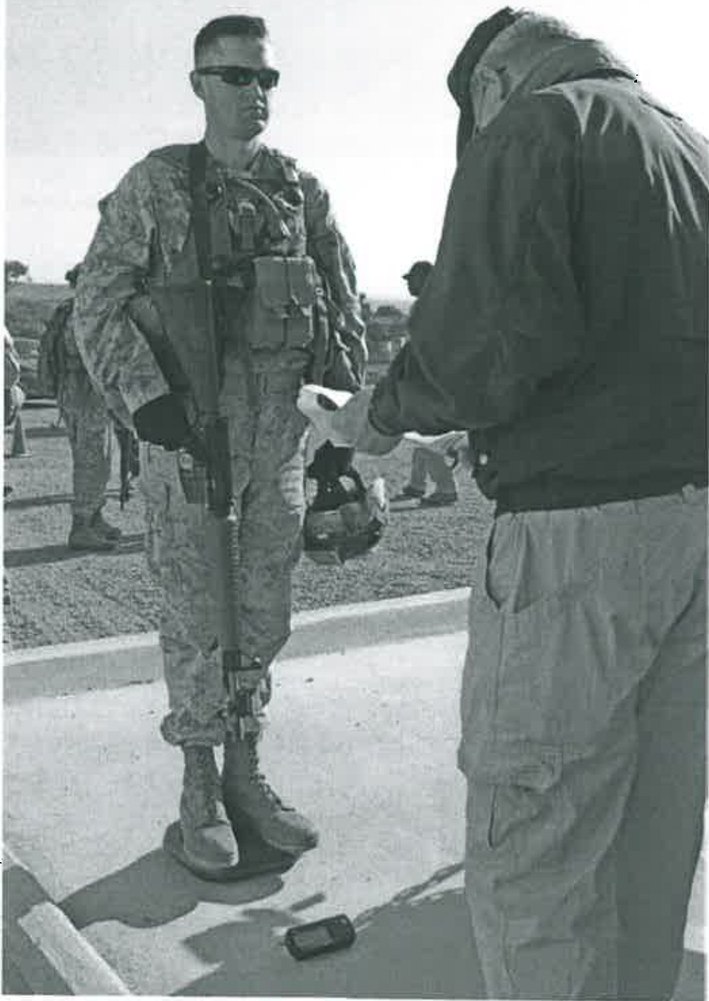
Marine weighs in before participating in body armor study

General Ralston, who was Commander of Air Combat Command prior to becoming Vice Chairman, had multiple assignments on the Air Force's Secretary and Air Staff in requirements, acquisition, plans, and operations, all of which indicated a balance between staff and operations experiences. 21 General Ralston, to