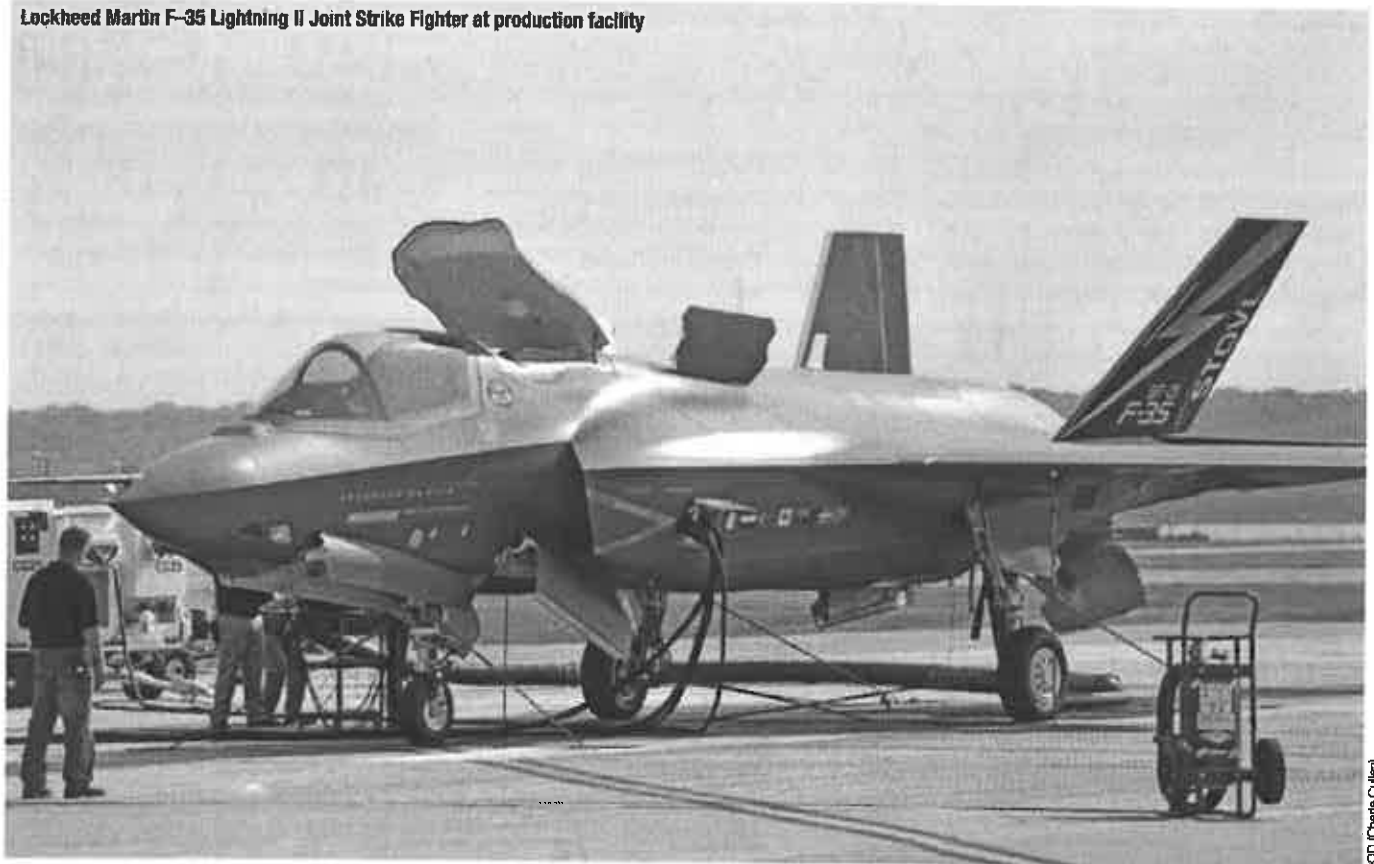
Lockheed Martin F-35 Lightning II Joint Strike Fighter at production facility