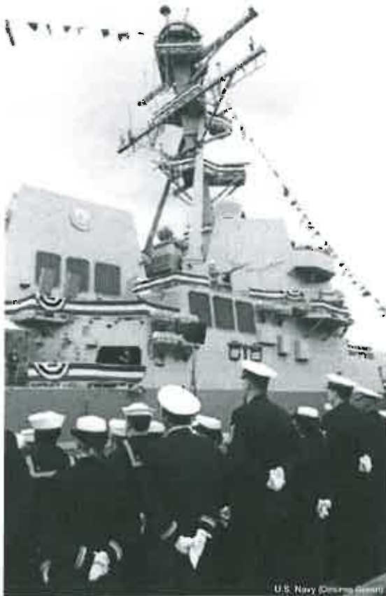
U.S. Navy’s newest Aegis destroyer, USS Wayne E. Meyer , commissioned October 10, 2009

more directly respond to the changing strategic environment, 6 of the 10 original JWCA domains changed and ultimately the number increased to 12 and then 14 as domains on interoperability, combating terrorism, reform initiative, and combat identification were created. 25 A leadership insight is that creating a lower board with proper responsibilities and an inclusive nature not only has the advantage of focusing a leader’s time, but it can also assist in developing future leaders and creating a joint climate. Conversely, increasing bureaucratic structure can have a negative effect in delaying or perhaps reducing the controversy associated with some issues that senior leaders need to hear as consensus is greatly valued before finally briefing these leaders.