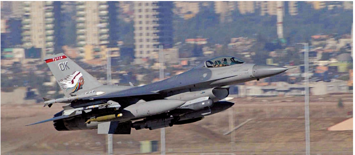
A U.S. Air Force F-16C Block 42 Fighting Falcon aircraft assigned to the 138th Fighter Wing, Oklahoma Air National Guard, takes off for a mission at Incirlik Air Base, Turkey, during Combined Task Force/Operation Northern Watch, November 17, 2002.

ForceSouthwestAsiawasestablishedby the United States Central Command. Units from the U.S. Air Force, U.S. Navy, and U.S. Army as well as Britain, France, Saudi Arabia, and later Kuwait enforced the southern no-fly zone. Coalition members contributed fighter patrols against potential targets, reconnaissance, suppression of enemy air defenses, air refueling, and special operations missions.