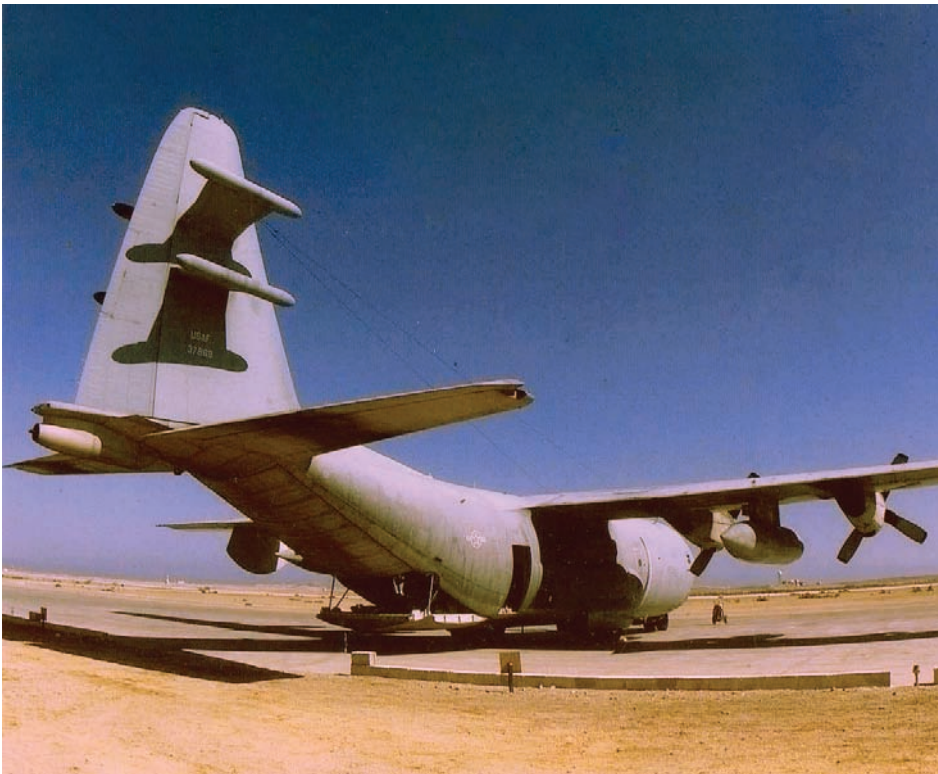
Commando Solo EC-130E from the 193rd Special Operations Wing, Pennsylvania Air National Guard, sits on the ramp at undisclosed location during Operations Enduring Freedom and Iraqi Freedom in late 2005.

initial combat employment of the Air Force's first (and as of 2007 only) blended wing: the newly formed 116th Air Control Wing, composed of ANG and active duty Air Force personnel based in Warner-Robins, Georgia. The wing deployed nine of its 11 assigned JSTARS