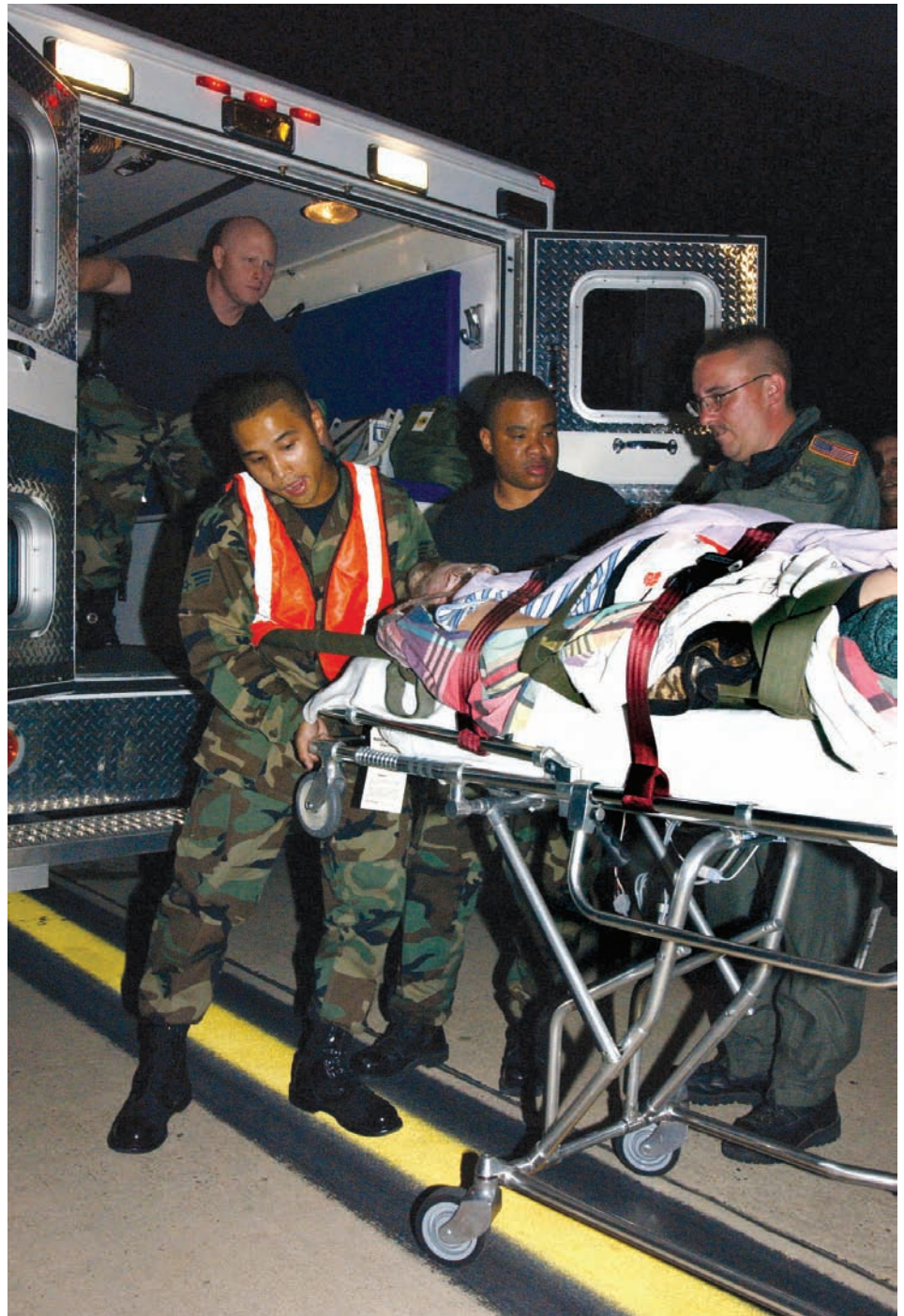
A Puerto Rico Air National Guard C-130 Hercules cargo aircraft flew patients evacuated from Keesler Air Force Base, Mississippi, because of Hurricane Katrina. Here personnel from the Puerto Rico Air National Guard prepare to load a stretcher-borne patient into a waiting ambulance to be taken to Wilford Hall Medical Center, Lackland Air Force Base, Texas, for further medical treatment, August 30, 2005.