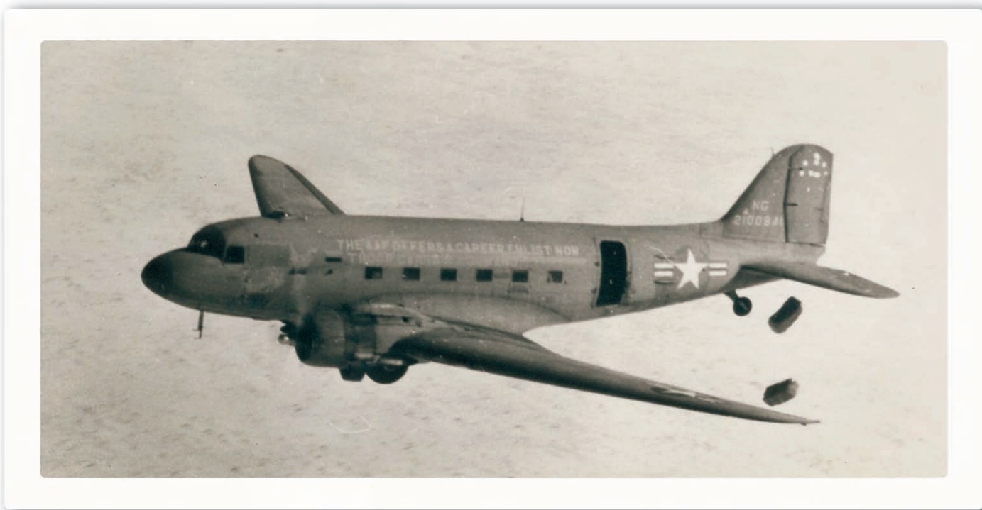
Following a devastating blizzard in 1949, Colorado Air Guard C-47s dropped hay to stranded and starving livestock throughout the Rocky Mountain region. Altogether the Colorado Air Guardsmen flew 17 such missions dropping tons of hay that saved thousands of cattle and wildlife. Colorado Air Guard F-51s and A-26s also flew 10 reconnaissance missions during that emergency, January 29, 1949.

Airborne Fire Fighting System (MAFFS), which underwent several updates since its first use in September 1971 by the 146th. Housed in C-130s, a MAFFS could disperse up to 27,000 pounds—almost 3,000 gallons—of commercial fire retardant or an equivalent amount of water. Newer aircraft like the C-130J held the MAFFS II, which carried even more fire retardant, could disperse it more rapidly over a wider area, and was easier to recharge after a mission than its predecessor. The growing number of significant forest fires in the 21st century challenged U.S. firefighting resources. Looking back on 2006, Colonel Harold Reed, 153rd Airlift Wing commander, explained that Wyoming Air Guard members used to get called out for wildfires about once every three years for one or two weeks at a time. Now they were being called out each year for about a month at a time. “It keeps us