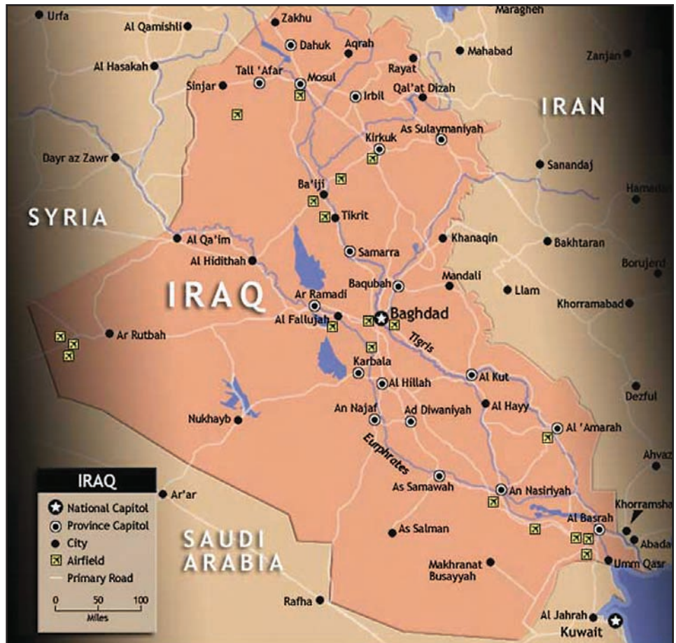
Iraq map. (Central Intelligence Agency.)

The ANG had six RED HORSE units assigned while the active duty had four, and the Air Force Reserve had two. Air Force RED HORSE support for Operation Enduring Freedom consisted of constructing new airfields for future air operations and repairing facilities that had deteriorated. Beginning in mid-April 2002 ANG RED HORSE units deployed to various overseas bases to support the Afghanistan War. The Air Force tasked an estimated $100 million worth of projects to RED HORSE units that year. Those