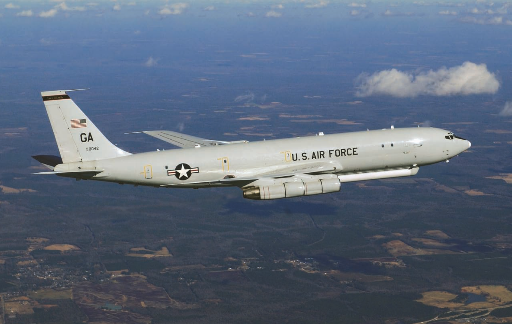
E8-C JSTARS flown by the 116th Air Control Wing, Robins Air Force Base, Georgia, a blended Air National Guard-Air Force organization, December 20, 2002.

new mission is extremely vital to the nation's defense."