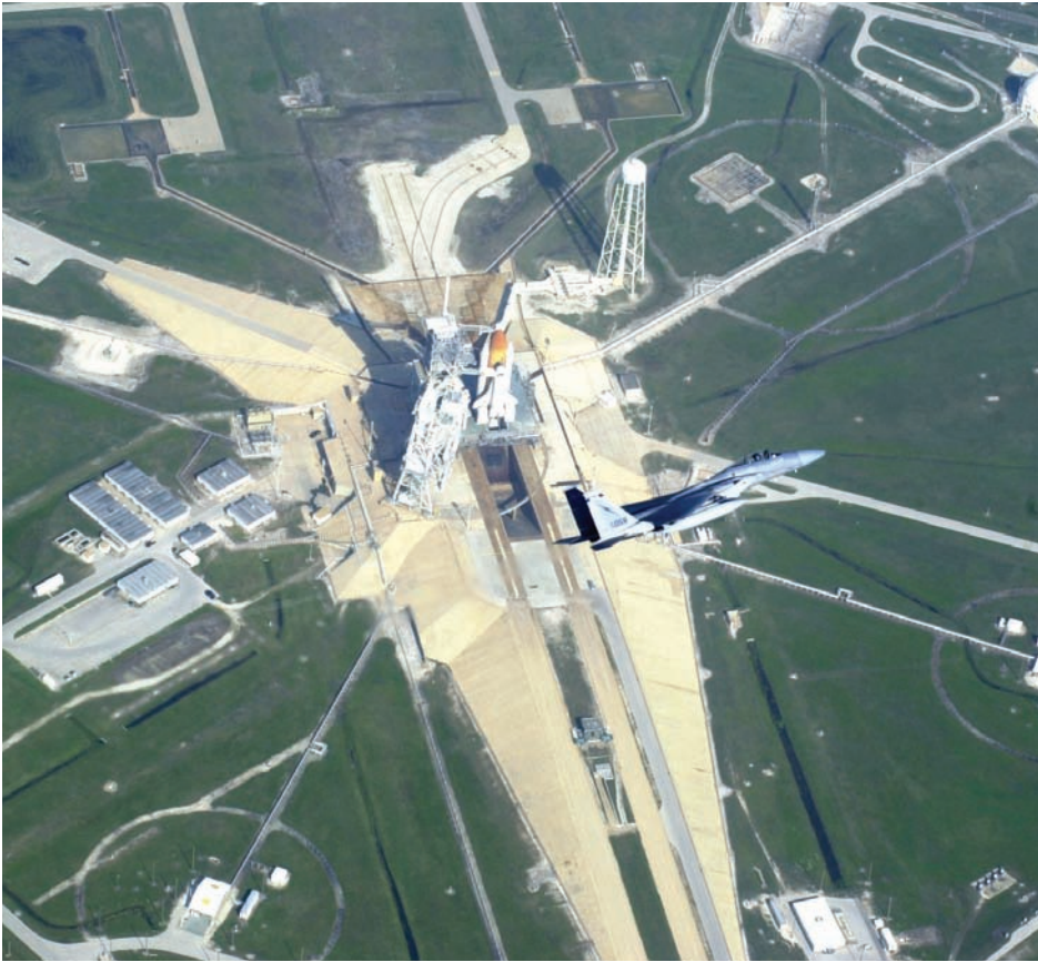
A Florida Air National Guard F-15A Eagle aircraft assigned to the 125th Fighter Wing flies a Combat Air Patrol mission over Cape Kennedy, Florida, for Operation Noble Eagle. The Space Shuttle Endeavor is positioned on the launch pad, November 29, 2001.

including having its fighter units become more heavily engaged in ongoing offensive operations overseas.