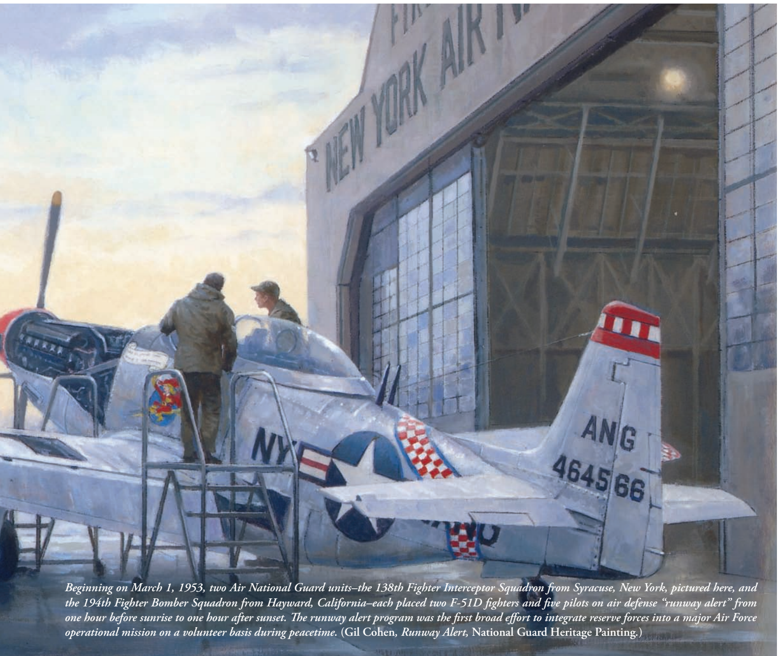
Beginning on March 1, 1953, two Air National Guard units—the 138th Fighter Interceptor Squadron from Syracuse, New York, pictured here, and the 194th Fighter Bomber Squadron from Hayward, California—each placed two F-51D fighters and five pilots on air defense “runway alert” from one hour before sunrise to one hour after sunset. The runway alert program was the first broad effort to integrate reserve forces into a major Air Force operational mission on a volunteer basis during peacetime. (Gil Cohen, Runway Alert, National Guard Heritage Painting.)

During and after the conflict in Korea, Congress played a key role in placing reserve programs on a sound footing. Congress was much more willing than either the Department of Defense or