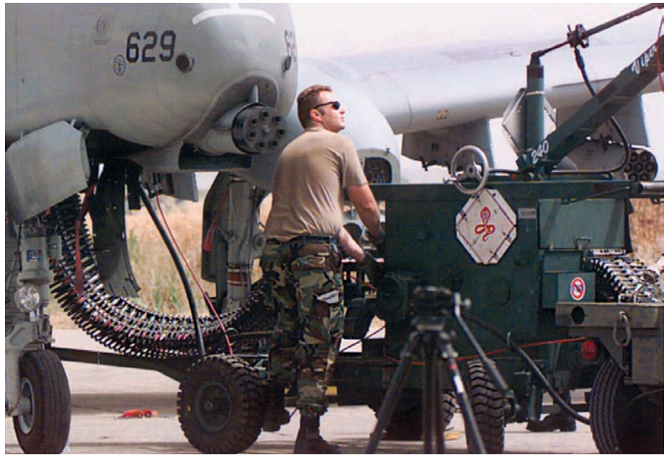
An A-10A from the Air National Guard's 104th Expeditionary Operations Group is armed for a combat mission at Trapani Air Base, Sicily, Italy, during Operation Allied Force, 1999.

Allied Force was a relatively one-sided military contest. The Serbs were isolated diplomatically and militarily and the tiny Serb air force could not challenge NATO. Moreover, allied airmen quickly destroyed or disabled the Serbian's small inventory of MiG-29 fighters. From the outset of hostilities the alliance rejected using ground forces and went to great lengths to avoid casualties among its