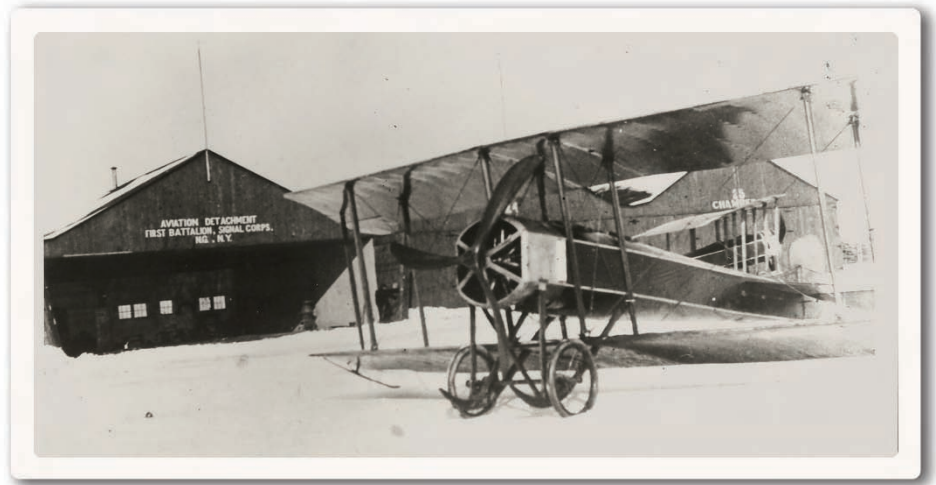
A Galludet Tractor biplane which the New York National Guard aviators rented in 1915.

Although the ANG was not officially established in law as a separate reserve component until September 18, 1947, National Guard aviation emerged before