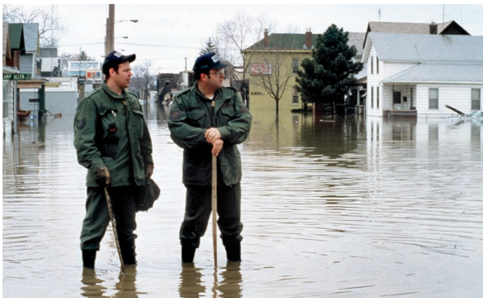
National Guard Airmen have been assisting state civil authorities in floods since at least the great Mississippi flood of 1927. Here members of the Indiana Air National Guard participate in an emergency operation after recent flooding in Fort Wayne, Indiana, March 1, 1982. LEFT: C-130E Hercules cargo aircraft from the 146th Airlift Wing, California, rigged with a Modular Airborne Fire Fighting System (MAFFS) makes a Phoschek fire retardant drop on the Simi Fire in Southern California, October 28, 2003.

Exemplifying the kind of work handled by Civil Support Teams, on February 28, 2007, a barge containing 220,000 gallons of an irritating chemical hit a lock on the Ohio River between Illinois and Kentucky sending approximately 10,000 gallons into the water. The spill gave off a foul smell and "caused quite a scare," observed the Heartland News. The chemical could "cause dizziness and irritate the eyes, nose, and throat" as well as "be damaging to animals directly exposed to it." Released as a liquid, it evaporated into a gas that threatened residents of Metropolis, Illinois. The spill caused that portion of the Ohio River to close. Kentucky's 41 CST, including four specially trained Air Guardsmen, responded immediately and began to monitor the air quality. Working in conjunction with the U.S. Coast Guard,