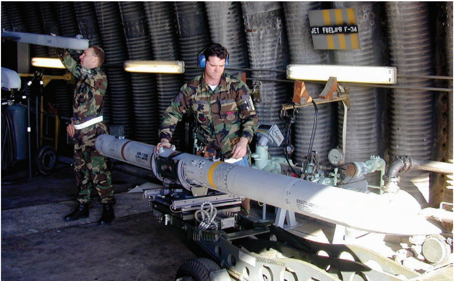
169th Fighter Wing Aircraft Generations Squadron, McEntire Air National Guard Station, South Carolina, personnel loading an AIM-120 Advanced Medium Range Air-to-Air Missile and other equipment onto an F-16CJ aircraft deployed at Incirlik Air Base, Turkey. The 169th Fighter Wing was deployed in Aerospace Expeditionary Force #4 during Operation Northern Watch. It was the first ANG F-16 unit equipped with Suppression of Enemy Air and Defenses (SEAD) technology, January 19, 2000.

ANG “rainbow” deployments to the Persian Gulf region that lasted about three months each. The experience of the Texas 147th Fighter Wing illustrated those rotations. Its split a 90-day Air Guard commitment with two other ANG F-16 units, New Jersey’s 177th Fighter Wing and Vermont’s 158th Fighter Wing. The Texas unit sent about 150 personnel and two F-16Cs to Prince Sultan Air Base in Saudi Arabia. Most American troops in Saudi Arabia’s capital, Riyadh, relocated to that isolated base following a terrorist bombing of U.S. Air Force barracks at a more urban Saudi Arabian base on June 15, 1996, that killed 19 airmen and wounded 547 others. Responsible for the middle portion of that deployment, those units relied primarily on F-16s provided by the New Jersey and Vermont