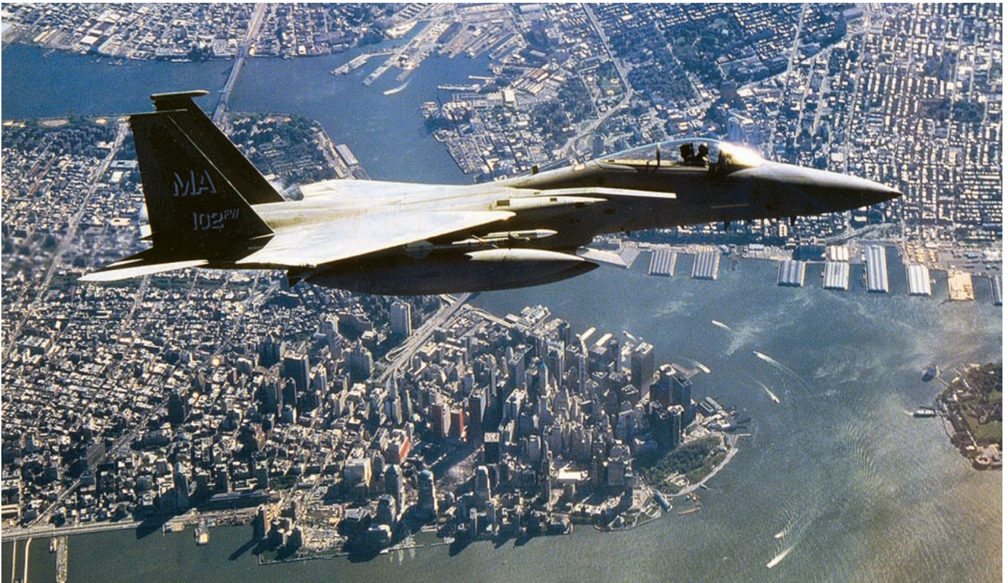
An F-15A Eagle from 102nd Fighter Wing, Massachusetts Air National Guard, flies a Combat Air Patrol over New York City as part of Operation Noble Eagle. F-15s from the 102nd were the first to arrive on scene over the World Trade Center following the September 11, 2001, terrorist attacks.

their search, air traffic in the skies over the United States was congested with over 4,000 airplanes at any given moment, most in the northeast. Moreover, the hijackers turned off the electronic transponder that helped FAA controllers identify commercial airliners. Weapons controllers throughout First Air Force, in any case, had limited access to the FAA's radar data from the nation's interior. Their entire system focused on detecting and tracking aircraft entering North America's airspace from overseas. It was virtually blind to flight activity within the continent leaving First Air Force unprepared to defend against attacks launched within the United States.