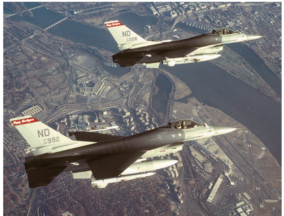
F-16s of the 119th Fighter Wing, North Dakota Air National Guard, fly a combat air patrol over Washington, DC, and the Pentagon in Operation Noble Eagle. November 2001.

Anticipating that the constant alerts would continue into the winter, the ANG civil engineers in the National Guard Bureau used emergency procedures, to conduct environmental impact studies, obtain funding, and award contracts for $35 million to build 42 temporary and permanent aircraft shelters and support facilities on bases in Maryland, New Jersey, Colorado, Vermont, Texas, California, North Dakota, Louisiana,