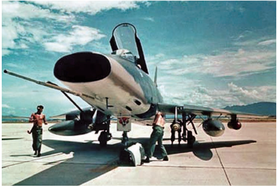
Ground crew prepares an F-100 of Colorado's 120th Tactical Fighter Squadron for combat mission at Phan Rang Air Base, South Vietnam.

Reliance on second-rate equipment and primitive living conditions during the Berlin call-ups continued to plague the Air Guard units deployed to western Europe. To ameliorate the problems