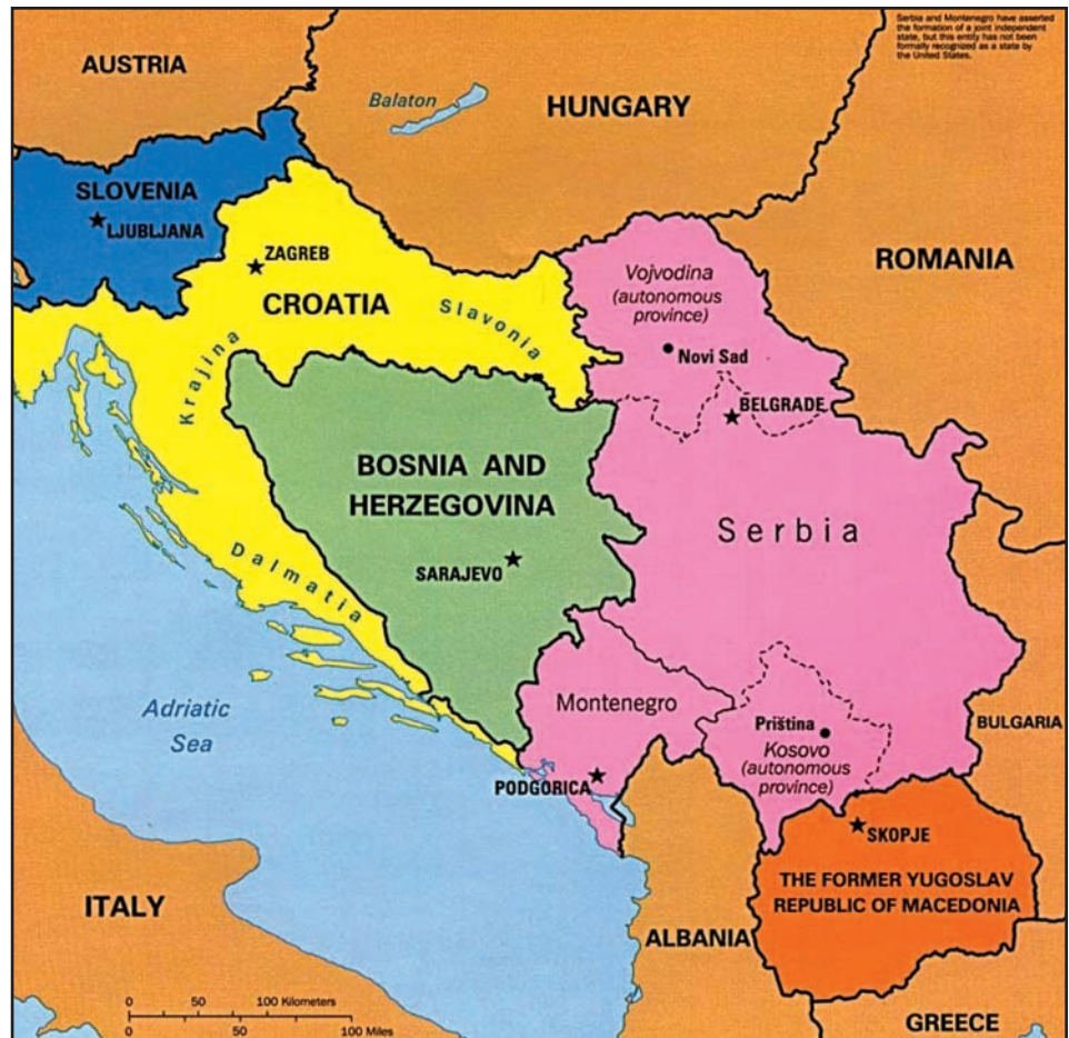
Former Yugoslavia, 1996. (Central Intelligence Agency.)

On April 2, 1993, NATO troops from Great Britain, France, the Netherlands, Spain, Turkey, Germany, and Italy as well as the United States launched Operation Deny Flight, a no-fly zone for Serbian aircraft over Bosnia-Herzegovina. It enforced a March 1993 UN Security Council Resolution passed to help prevent the war from spreading. The operation also provided close air support to UN ground forces serving as peacekeepers, and air strikes against Serb weapons threatening UN-designated safe areas in Bosnia. The first ANG fighter unit involved was Connecticut's A-10-equipped 103rd Fighter Group. Aircraft and personnel from Maryland's 175th Fighter Group and Michigan's 110th Fighter Group