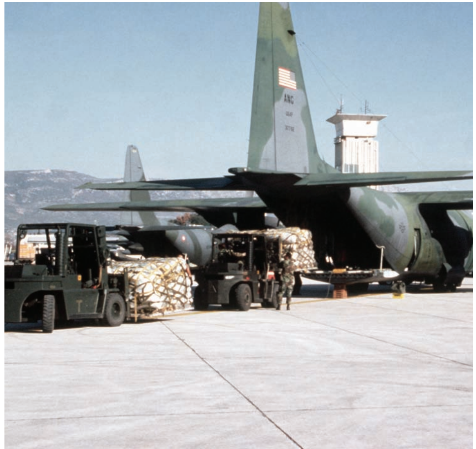
Air National Guard personnel use forklifts to unload pallets of cargo from a C-130 Hercules aircraft in Split, Croatia, December 1, 1994.

One of the most critical modernization challenges facing the ANG involved its extensive fleet of older model F-16s, especially the requirement to conduct precision attacks of ground targets around-the-clock in poor weather conditions. Historically, the Air Force