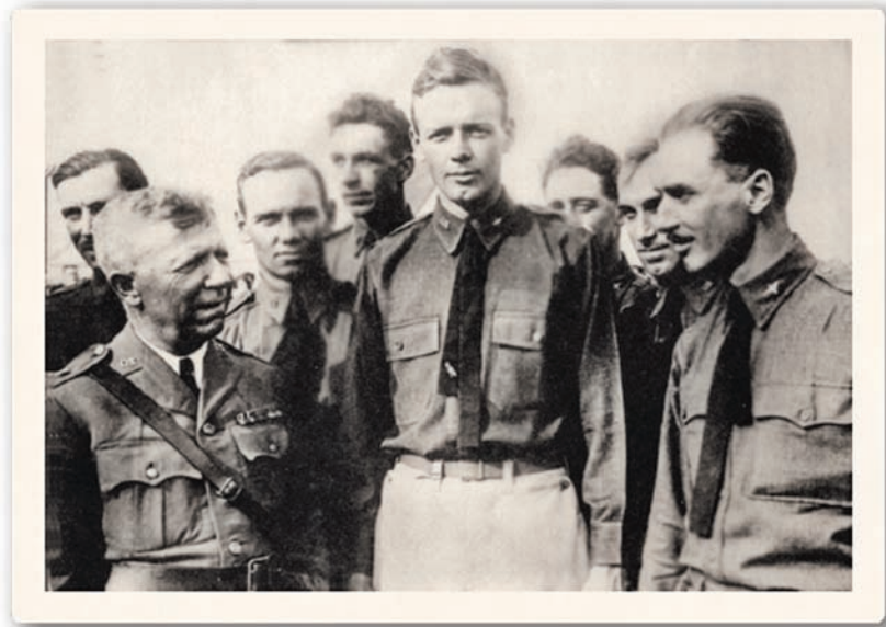
Captain Charles A. Lindbergh, Missouri National Guard, and members of his National Guard unit, 110th Observation Squadron, after he flew solo across the Atlantic Ocean, 1927.