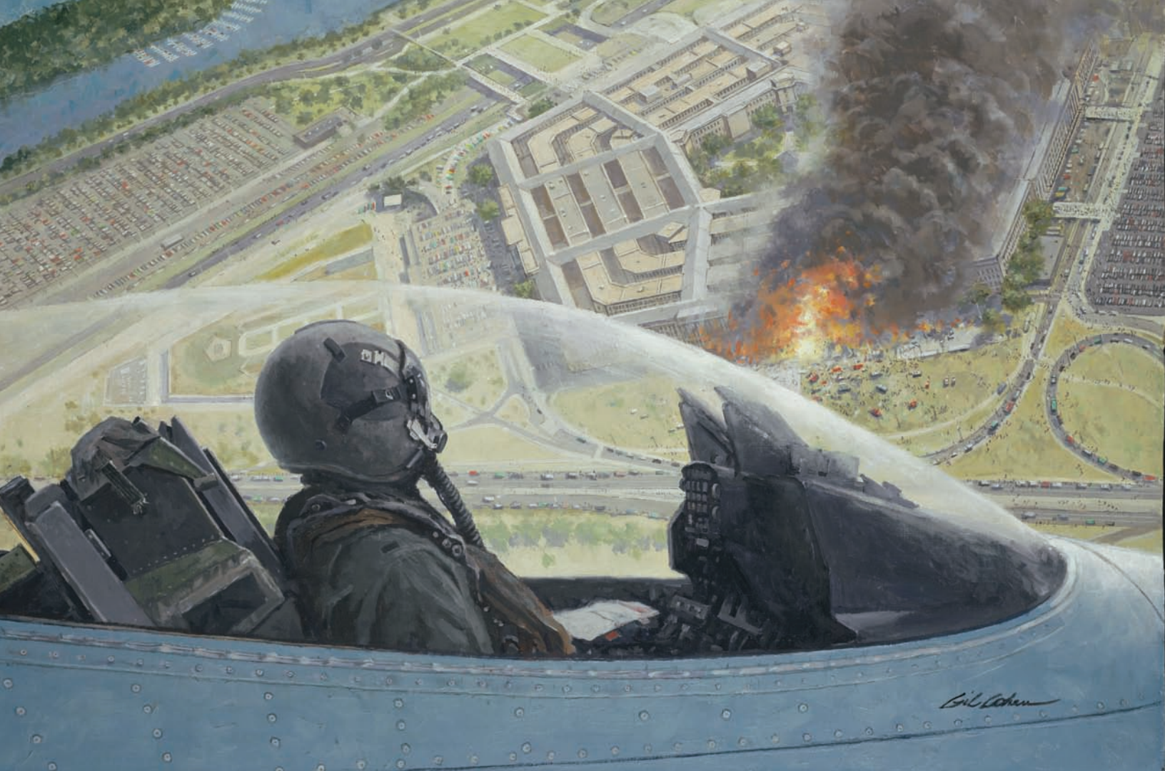
An Air National Guard F-16 on a combat air patrol over the burning Pentagon on September 11, 2001, after the hijacked Flight 77 crashed into it. (Gil Cohen, 9/11, National Guard Heritage Painting.)

to launch, at Langley Air Force Base, Virginia, located about 130 miles southeast of Washington, DC. They were at their battle stations because of a growing general concern about the situation that morning. Seven minutes later the FAA reported that United Airlines Flight 93, outbound from Newark, New Jersey, to San Francisco, California, might also have been hijacked. The FAA notified the Northeast Air Defense Sector eight minutes later that American Flight 77, a flight from Dulles International Airport, Virginia, near Washington, DC, to Los Angeles, California, also appeared to be the victim of hijackers. At 9:24 a.m. Colonel Marr ordered three F-16s (two alert aircraft and a spare) scrambled from Langley to check out an unidentified intermittent aircraft track heading toward Washington,