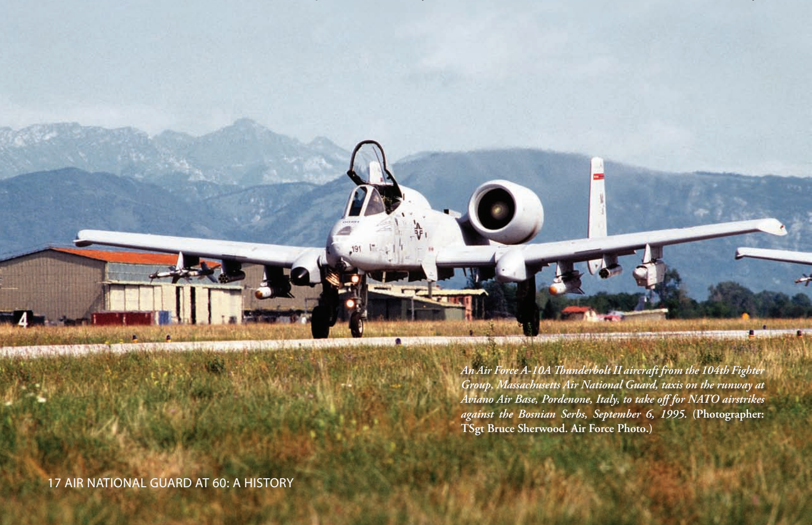
An Air Force A-10A Thunderbolt II aircraft from the 104th Fighter Group, Massachusetts Air National Guard, taxis on the runway at Aviano Air Base, Pordenone, Italy, to take off for NATO airstrikes against the Bosnian Serbs, September 6, 1995.

Senior Master Sergeant Bob Myco crawled under the A-10 Thunderbolt at the end of the foreign runway, carefully performing a last-minute inspection. Also known as the Warthog, the Flying Gun, and the Tankbuster, the A-10 had as its mission ground attacks against tanks, armored vehicles and installations, and close air support of ground forces. Sergeant Myco looked for cuts in the tires, gas or oil leaks, and exterior panels that had not been properly secured. Weapons personnel removed safety devices from the aircraft's missiles and the pilot was ready to launch. As the A-10 taxied to the runway,