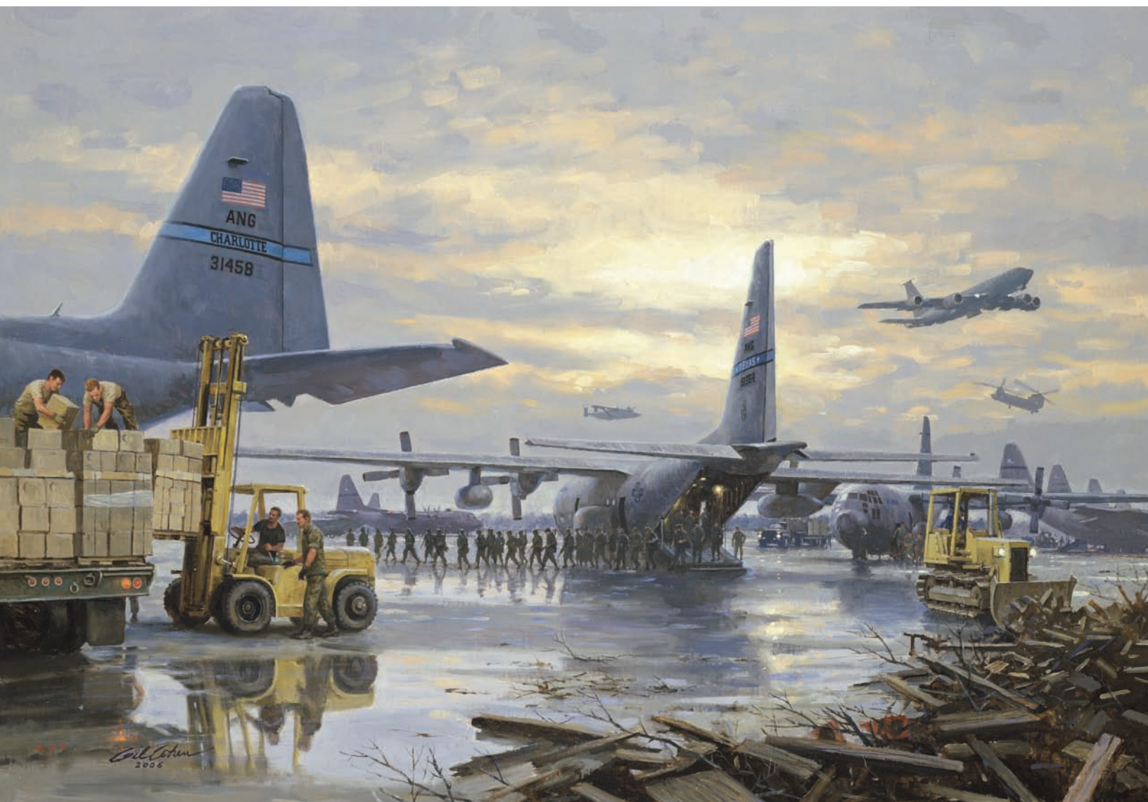
New Orleans Naval Air Station Joint Reserve Base (Alvin Callender Field), Belle Chasse, Louisiana, September 1, 2005. (Gil Cohen, In Katrina's Wake, National Guard Heritage Painting.)