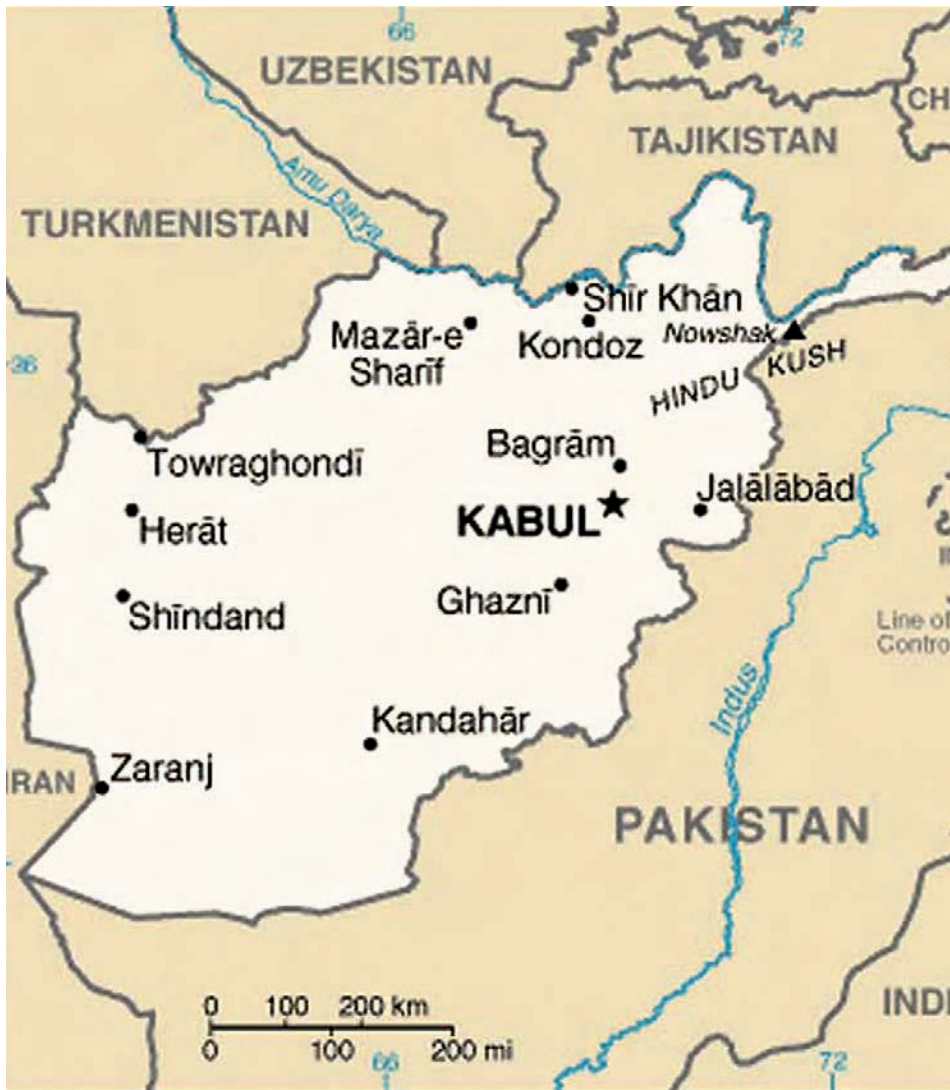
Map of Afghanistan (Central Intelligence Agency).

arugged topography. The tribes that lived there were known not to run from a good fight. In the southern third of the country, the landscape contained a desert-like plateau where nomads and others scampered freely across the Afghan-Pakistan border in both directions. The central two-thirds of the country contained the Hindu Kush Mountains, a chain almost 1,000 miles long and 200 miles wide. The mountains ran from the northeast out of northern Pakistan to the southwest into Iran. The ranges contained more than 20 peaks higher than 23,000 feet above sea level with deep valleys in between. Afghanistan had only 16 miles of railroad and its roads were in less-than-desirable condition. The land was hard, and so were the lessons learned