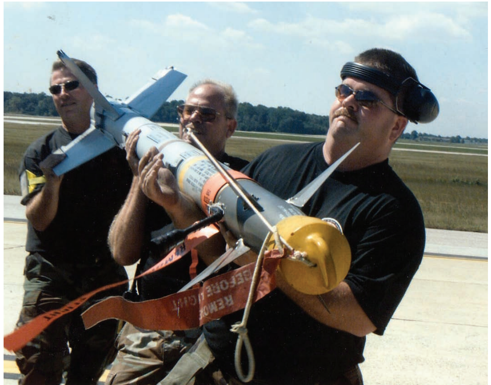
Members of the 121st Fighter Squadron, 113th Wing, District of Columbia Air National Guard, September 11, 2001, prepare to load a missile on an F-16 at Andrews AFB, Maryland, in response to the terrorist attacks on the United States that took place earlier that day.