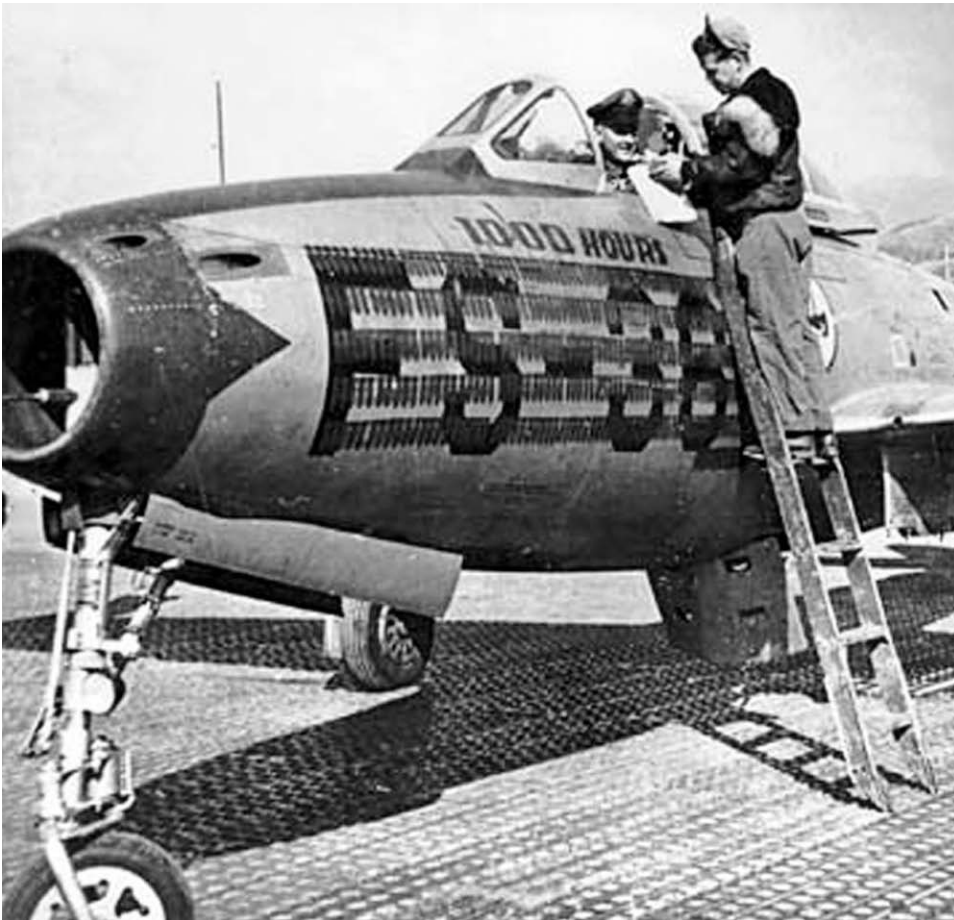
Captain John McMahn and Sergeant White, of the 182nd Fighter Bomb Squadron, Texas Air National Guard, close out flight records at Taegu, South Korea, following their B-29 becoming the first such aircraft to complete 1,000 flying hours, 1952.

the military services to fund the reserves properly. Moreover, beginning with the passage of the Armed Forces Reserve Act of 1952, a series of key laws fostered the development of more effective reserve components.