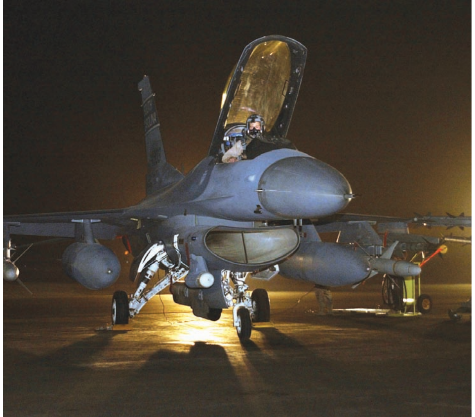
A South Carolina Air National Guard F-16C Fighting Falcon aircraft from the 157th Expeditionary Fighter Squadron, 379th Air Expeditionary Wing, is recovered following a nighttime mission at a forward deployed location during Operation Iraqi Freedom. The aircraft is armed with AIM-120B Advanced Medium Range Air-to-Air Missiles, AIM-9 Sidewinder missiles, and AGM-88 High-Speed Antiradiation Missiles, March 23, 2003.

As in Afghanistan, the Air Guard contributed significant transportation capability to Operation Iraqi Freedom. Thirteen of ANG's 25 airlift units participated, including 72 of 124 Air Force C-130s. Among their missions, Air