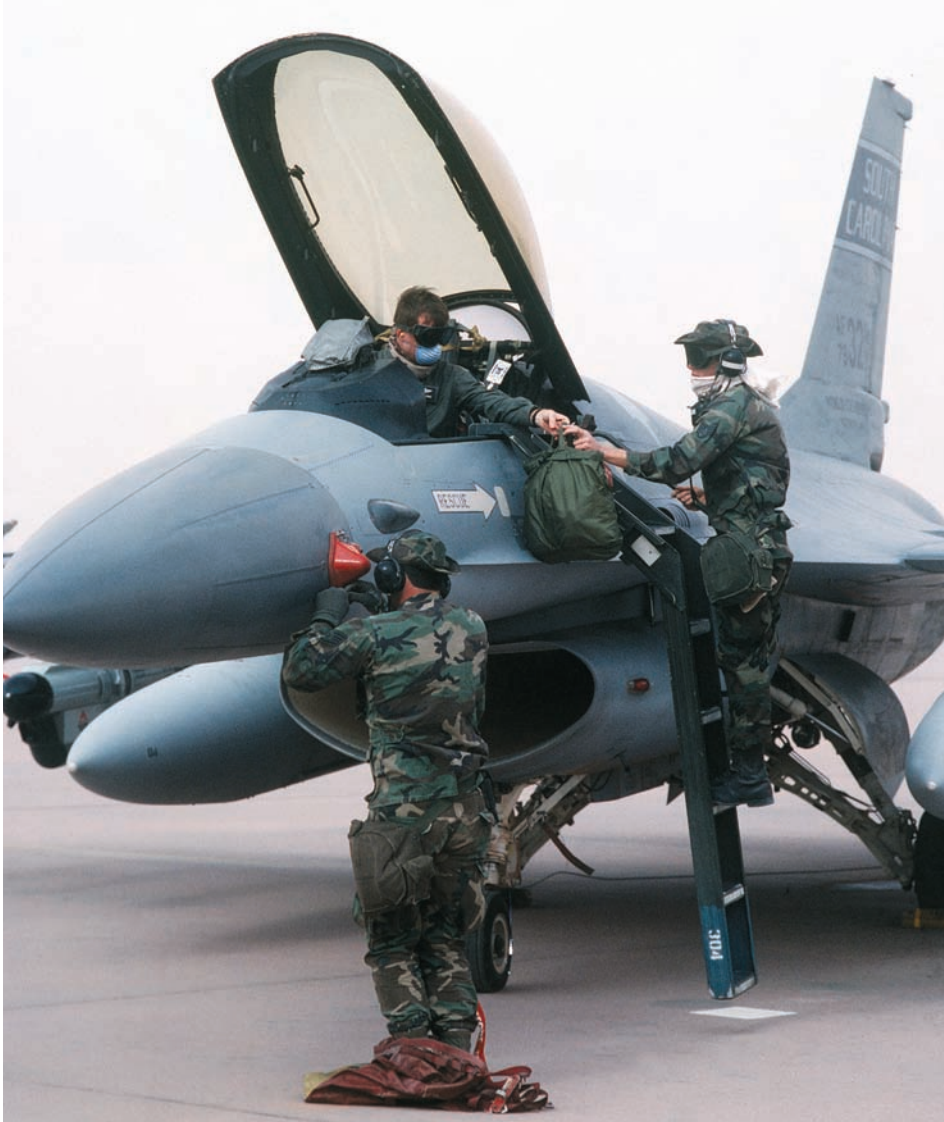
The pilot of a 157th Tactical Fighter Squadron F-16A Fighting Falcon aircraft of the South Carolina Air National Guard prepares for a mission with the help of two ground crewmen. The 157th is one of several squadrons combined to form the 4th Tactical Fighter Wing (Provisional) during Operation Desert Storm.

National Guard Bureau authorized the state to enlist and appoint women to nonmedical positions.