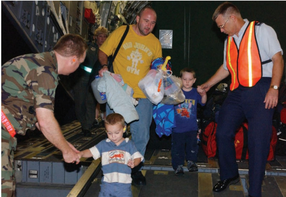
Mississippi Air National Guard (MSANG) personnel assist these displaced civilians as they disembark from MSANG C-17A Globemaster III cargo aircraft. These people were evacuated from Keesler Air Force Base, Mississippi, due to flooding from Hurricane Katrina and flown to Kelly City Base, Texas, August 30, 2005.