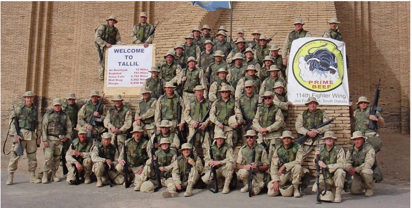
The 114th Fighter Wing, South Dakota Air National Guard, Prime Base Engineer Emergency Force (Prime BEEF), at Tallil Air Base, Iraq. The photo was taken near Tallil Air Base, in the ruins of Ur, considered one of the oldest cities in the world, 2003.

Rangers began taking increasing enemy fire from the south as well as coordinated attacks at both ends of the dam. Although the Rangers repelled the initial assault, Iraqi counterattacks continued with heavy mortar and artillery shell that rained down on the Rangers. Fortunately, the Rangers had ample air support from the 410th,