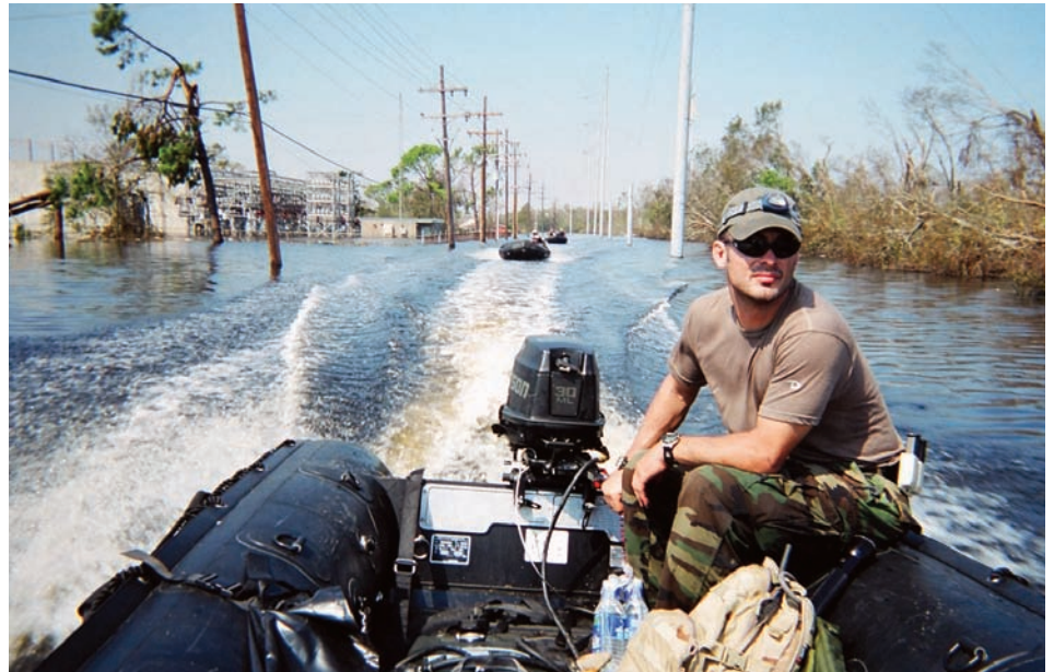
Kentucky Air National Guardsmen, 123rd Special Tactics Squadron, setting out with Zodiac boats to rescue survivors of Hurricane Katrina in New Orleans, 2005. BELOW: A US Air Force C-5 Galaxy, 105th Airlift Wing, New York Air National Guard, Stewart International airport, New York, sits on a ramp at the Gulfport Combat Readiness Training Center, Mississippi, as airmen with the 137th Airlift Squadron unload the cargo bay full of support vehicles and equipment for Hurricane Katrina relief operations.

“The shortest distance between a disaster and humanitarian assistance is an