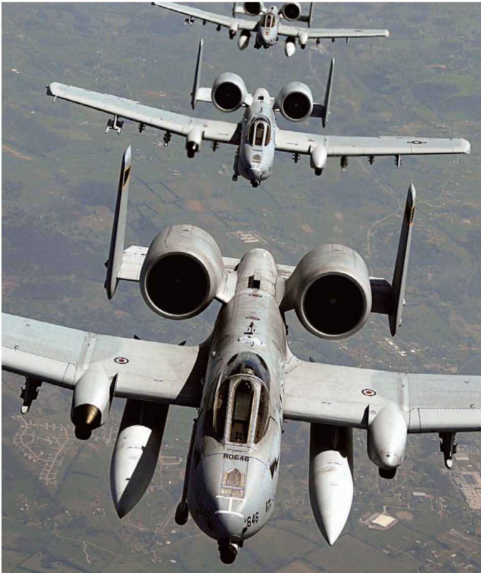
Three Connecticut Air National Guard 103rd Fighter Wing A-10A Thunderbolt II attack aircraft fly in trail formation in preparation to refuel from a KC-135R Stratotanker aerial refueling aircraft as they fly to their new home base with the 188th Fighter Wing, Arkansas Air National Guard, at Fort Smith, Arkansas, as part of a Base Realignment and Closure (BRAC) reorganization, April 10, 2007.

Nebraska, associated as a unit with the 55th Wing also based at Offutt. As with the 116th in Georgia, 170th Air National Guardsmen worked together with active duty airmen; unlike the 116th, they had a separate administrative structure. The 55th Wing was home to Rivet Joint surveillance aircraft. Like JSTARS, Rivet Joint also operated in Desert Storm. It used automated and manual equipment for electronic and intelligence specialists to locate, record, and analyze