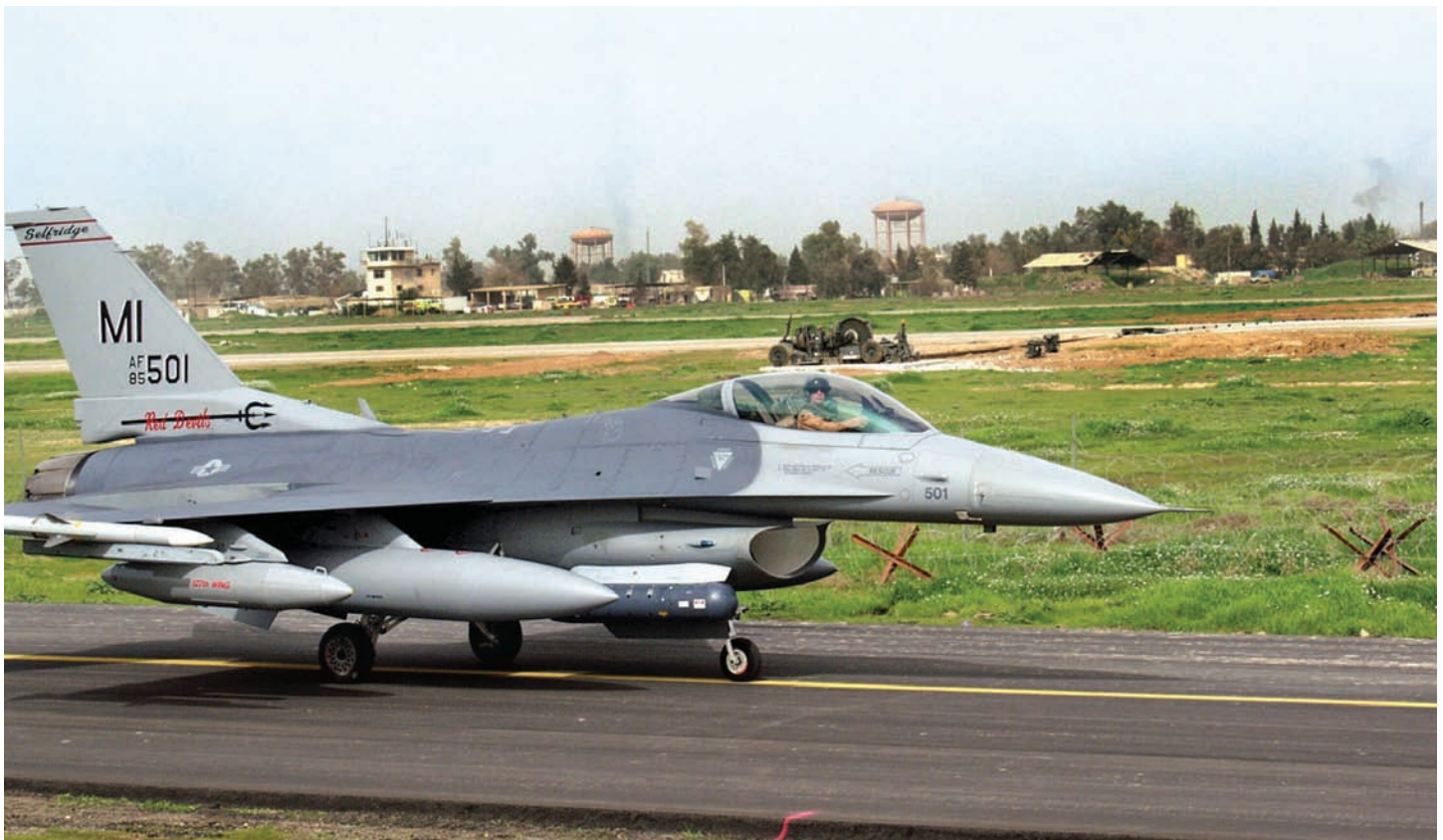
An F-16C Block 30, 107th Fighter Squadron, 127th Wing, Michigan ANG, carrying LITENING II pods in Kirkuk, Iraq. The 107th was the first F-16 unit in the Total Air Force to be based in Iraq.

LITENING II targeting pods allowed a precise fix of the location of enemy vehicles. The Air Force Reserve and Air National Guard developed that pod in conjunction with the Air Force and defense contractors because the active force could not provide the equipment needed by the Air Reserve Components to equip their fighter units for precision attacks under any conditions.