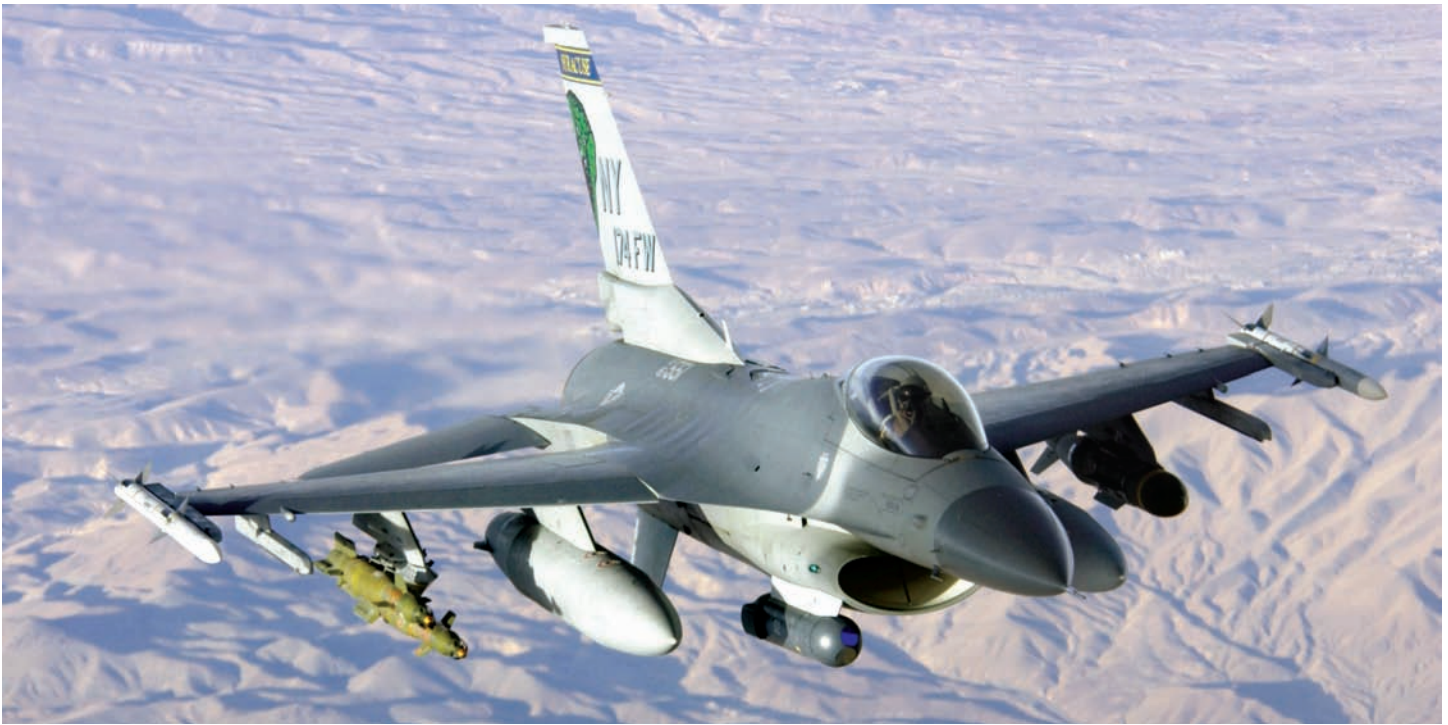
A US Air Force F-16C Fighting Falcon, 174th Fighter Wing, New York Air National Guard, Syracuse, New York, in flight over Afghanistan during Operation Enduring Freedom. The aircraft is armed with AIM-120A Advanced Medium Range Air-to-Air Missiles on each wing tip, a pair of GBU-12 500-pound bombs (left), a 370-gallon tank. It also has an AN/AAQ-28(V) LITENING II targeting pod under the intake, November 29, 2003.