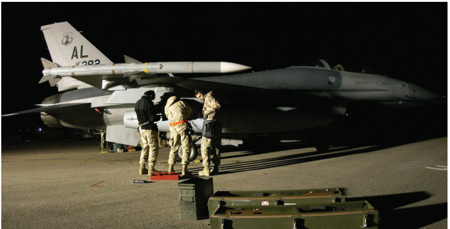
Munitions personnel from the 160th Fighter Squadron, 187th Fighter Wing, Alabama Air National Guard, assigned to the 410th Air Expeditionary Wing at a forward deployed location work on guided munitions on the pylon of one of their F-16C Fighting Falcons. The Falcon has an AIM-120A Advanced Medium Air-to-Air Missile fixed to the wing tip. The 410th Air Expeditionary Wing prepares the aircraft for take off for sorties on A-Day, the commencement of the air war for Operation Iraqi Freedom, March 19, 2003.