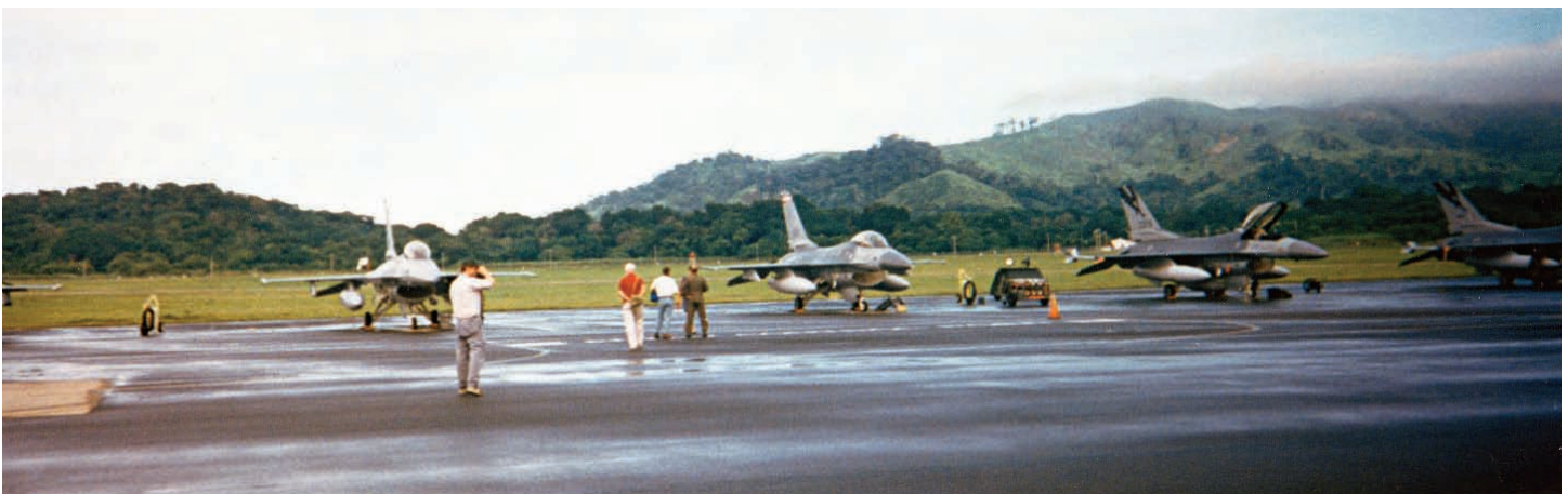
F-16ADFs from the 144th Fighter Wing, California Air National Guard, and the 119th Fighter Wing, North Dakota Air National Guard, at Howard Air Base, Panama, for Operation Nighthawk, June 1996.