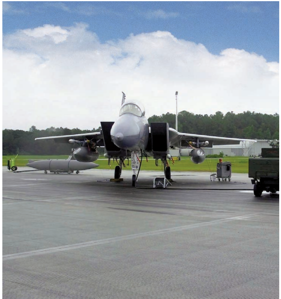
An F-15 Eagle, from the 125th Fighter Wing, Florida Air National Guard, sits on alert armed with AIM-120 Advanced Medium Range Air-to-Air Missiles, and AIM-9 Sidewinders after the terrorist attacks on the World Trade Center and the Pentagon.

Secondly, the new secretary was put off by what he perceived as the cautious, risk adverse approach of military leaders who had cut their professional teeth during the Vietnam War. He believed their mindset focused on winning large, conventional armed conflicts against other nations. With the disappearance of the Soviet military machine and the emergence of the United States as the world's only superpower, Secretary Rumsfeld doubted that any such convenient enemies would ever present themselves as sacrificial lambs to be easily destroyed by the awesome conventional and nuclear firepower of the U.S. armed forces. Assuming the nation had entered an era of deep peace with no peer competitors likely to challenge its military power for decades, Secretary Rumsfeld proclaimed his department would undergo a military transformation. The nation's armed forces would reshape into smaller but more lethal and flexible formations that could deal with a broad spectrum of threats through increased mobility and greater reliance on stealthy, high technology, long-range stand-off weapons. Furthermore, fewer ground