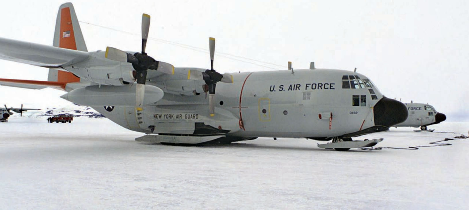
LC-130Hs equipped with landing skis, operated by the 109th Airlift Squadron, New York Air National Guard, parked on the ice pack at McMurdo Station at Ross Island in Antarctica during Operation Deep Freeze 2001. The unit operates six LC-130s between Christchurch, New Zealand, and a number of U.S. National Science Foundation stations located on the Antarctic ice pack, November 5, 2001.

danger the Guardsmen faced near the border. "You see 'coyotes' [smugglers] with truckloads of people just speeding through," explained National Guard Bureau Historian William Boehm, who visited the border operations in September 2006. "It's a nasty place."