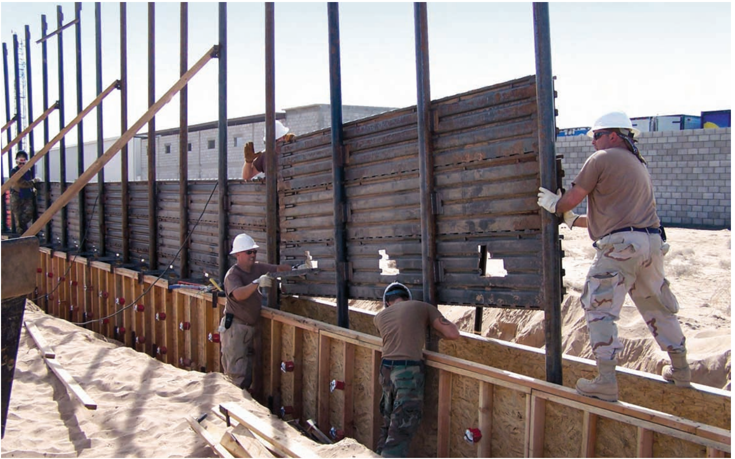
Air National Guard airmen of the 188th Fighter Wing, Arkansas Air National Guard, install a fence along the U.S.-Mexico border east of San Luis, Arizona. The Guardsmen were working in partnership with the U.S. Border Patrol as part of Operation Jump Start, October 3, 2006.

the Department of Homeland Security. Some National Guard units helped the CBP by building a fence along a portion of the border and assisting in the effort to staunch the flow of illegal drugs into the United States.