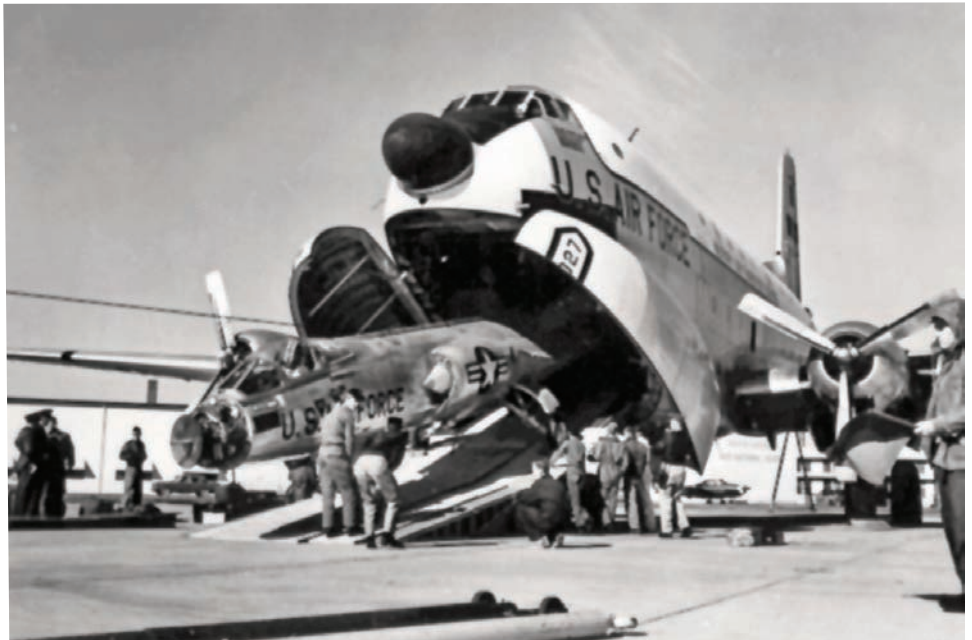
F-104A from the 157th Fighter Interceptor Squadron, South Carolina Air National Guard, is loaded aboard a C-124 for shipment to Europe during the Berlin crisis, 1961.