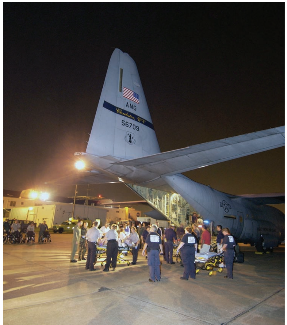
U.S. Air Force and civilian medical personnel offload patients from a C-130H Hercules aircraft from the 130th Airlift Wing, West Virginia, Air National Guard, shortly after arriving at Houston, Texas. Department of Defense units were mobilizing as part of Joint Task Force Katrina to support the Federal Emergency Management Agency's disaster-relief efforts in the Coast areas devastated by Hurricane Katrina.

Katrina also provided the first real-time opportunity for the Air National Guard's Expeditionary Medical Support (EMEDS) teams to deploy in response to a domestic natural disaster. EMEDS was a collection of small, modular medical units that replaced larger theater hospitals. The